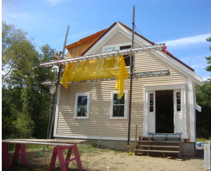
645 Center Street Habitat for Humanity House – September 2014

The CPA provides that community preservation funds may be expended "for the creation, preservation and support of community housing and for the rehabilitation or restoration ... of community housing," but not including maintenance. Hanover's community housing resources and needs are currently detailed in the 2013 Hanover Affordable Housing Plan. The average price of homes and rental units in Hanover has risen far beyond what many moderate-income families, Town employees and people who work in Hanover are able to afford. Community housing opportunities help attract and retain, among others, low and moderate-income families, the elderly on fixed incomes, the disabled, young persons and public and private employees upon whom the Town depends to provide high quality services in and for the Town.