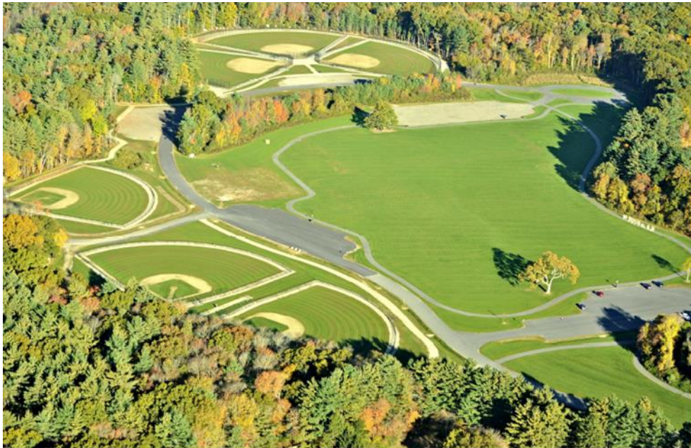
Forge Pond Park, opened in 2014

The Town of Hanover is a community that resonates with character from its history, open spaces, scenic views and the people who live here. Maintaining the original character and ensuring that open space, natural resources and recreation continues to stay on the forefront of residents minds as the town continues to manage its growth is essential to those who live in Hanover. As a semi-rural suburban community in the metro Boston region, Hanover is an attractive community for both residential and commercial development. Land is a finite resource, so competing needs of the development community and the efforts of planning projects such as the Open Space and Recreation Plan (OSRP) update become evident. Continuing to manage and guide growth while protecting open space and natural resources and providing meaningful recreational opportunities will continue to be a challenge in the future. Although the town has continued to experience significant residential development over the last five years, Hanover retains certain natural and scenic resources, including wetlands, diverse wildlife, conservation areas, ponds, rivers and open space. These resources contribute to making the Town a desirable place to live, fueling its continued residential growth.