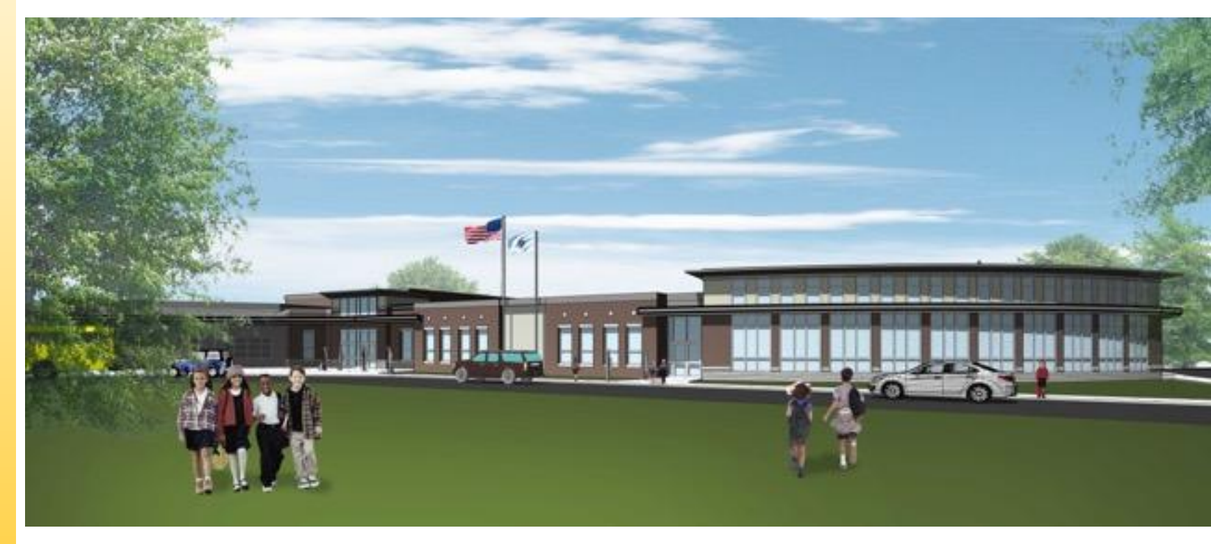
Sylvester School Solution