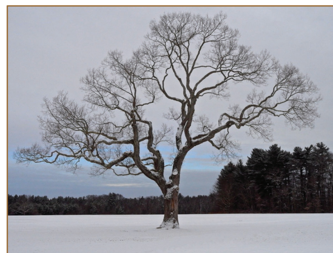
Lone Tree at Forge Pond Park

NOTE: Please be aware that Deer Hunting ( with Bow and Arrow only ) is allowed on the Clark Bog parcel and the Summer St. parcel during Deer Hunting Season only. Please contact the Conservation Staff or the Town Clerk at 781-826-5000 for seasonal dates of deer/bow hunting. The Town of Hanover provides for the recreational use of Conservation Land free of charge to the public. In accordance with the Massachusetts General Laws, Chapter 21, Section 17C, the Town is not liable for any injuries sustained to persons or property in their pursuit of recreational activities.