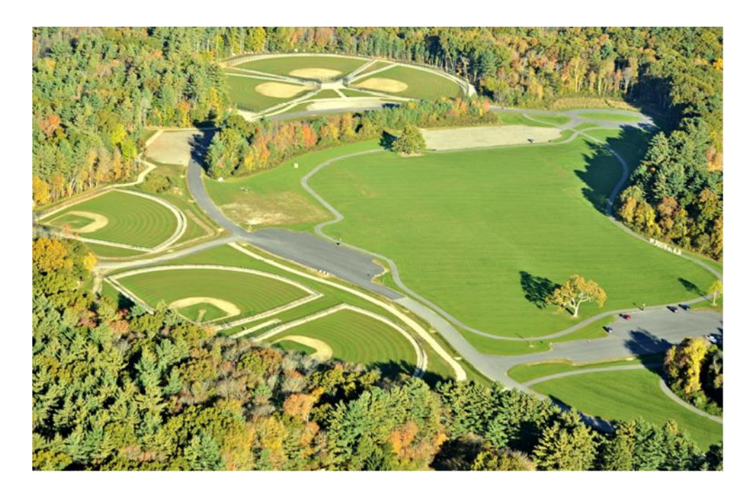
Forge Pond Park, opened in 2014

The Town of Hanover is a community that resonates with character from its history, open spaces, scenic views and the people who live here. Maintaining the original character and ensuring that open space, natural resources and recreation continues to stay on the forefront of residents minds as the town continues to manage its growth is essential to those who live in Hanover. As a semi-rural suburban community in the metro Boston region, Hanover is an attractive community for both residential and commercial development. Land is a finite resource, so competing needs of the development community and the efforts of planning projects such as the Open Space and Recreation Plan (OSRP) update become evident. Continuing to manage and guide growth while protecting open space and natural resources and providing meaningful recreational opportunities will continue to be a challenge in the future. Although the town has continued to experience significant residential development over the last five years, Hanover retains certain natural and scenic resources, including wetlands, diverse wildlife, conservation areas, ponds, rivers and open space. These resources contribute to making the Town a desirable place to live, fueling its continued residential growth.