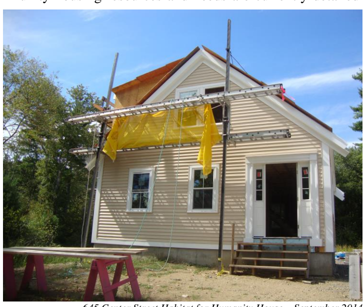
645 Center Street Habitat for Humanity House – September 2014

the 2013 Hanover Affordable Housing Plan. The average price of homes and rental units in Hanover has risen far beyond what many moderate-income families, Town employees and people who work in Hanover are able to afford. Community housing opportunities help attract and retain, among others, low and moderateincome families, the elderly on fixed incomes, the disabled, young persons and public and private employees upon whom the Town depends to provide high quality services in and for the Town.