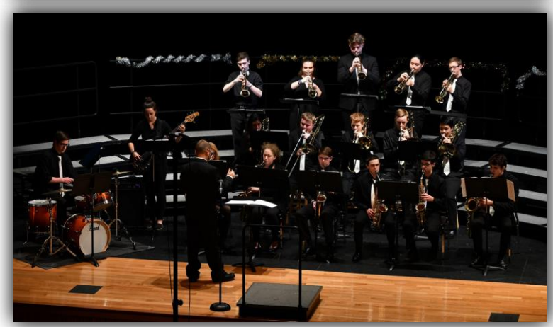
March 6, 2019